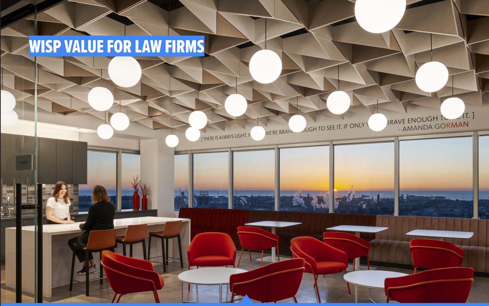
Confidential Client, El Segundo, CA